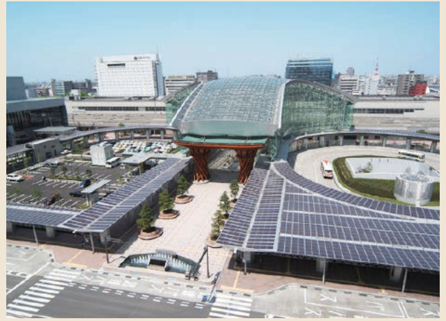
JR Kanazawa Motenashi Dome (above ground)

2 Kinoshinbo-machi, Kanazawa 920-0858 Kanazawa Station Event Area Operation Center TEL: 076-221-5952 FAX: 076-221-5952 URL: https://www4.city.kanazawa.lg.jp/kurashi_tetsuzuki/chokai_kyodo_shiminkatsudo/shiminkatsudo/10337.html